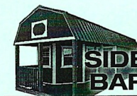
METAL DELUXE SIDE LOFTED BARN CABIN